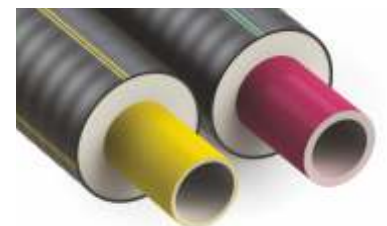
Pre-insulated pipes: FibreFlex (left) and PEX SDR 11 (right)

The FibreFlex pipes are continuously insulated during the manufacturing process, using a CFC-free bonded polyurethane foam, which offers an outstanding thermal conductivity value of \leq 0.021 W/mK at 50 °C